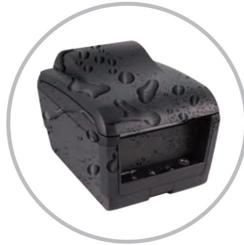
Spill-resistant and dust-proof design